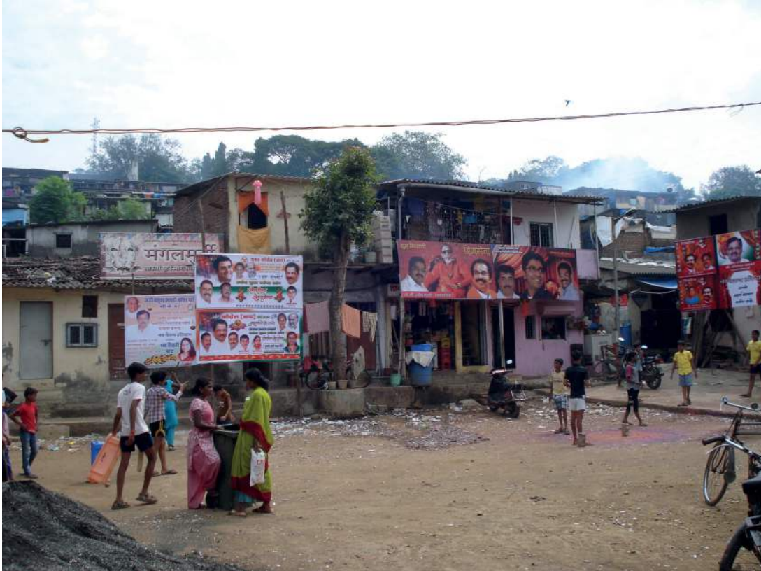
Photograph A for Question 3(a).