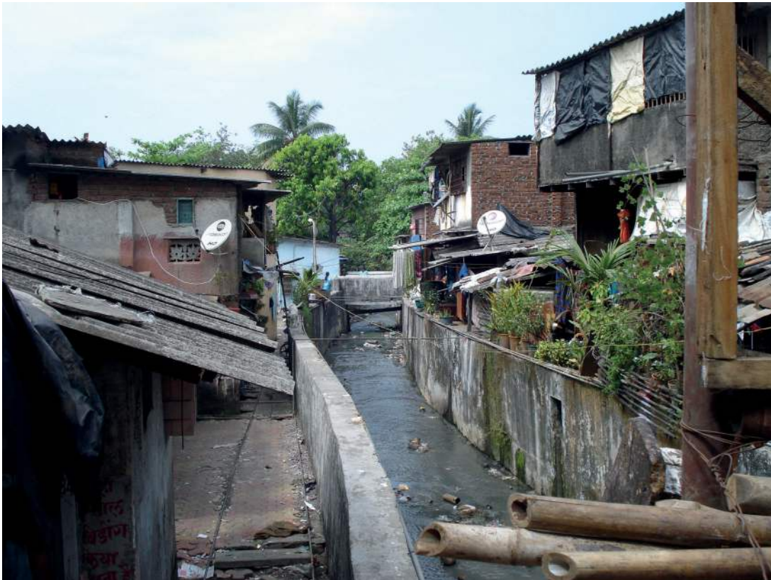
Photograph B for Question 3(a).

Permission to reproduce items where third-party owned material protected by copyright is included has been sought and cleared where possible. Every reasonable effort has been made by the publisher (UCLES) to trace copyright holders, but if any items requiring clearance have unwittingly been included, the publisher will be pleased to make amends at the earliest possible opportunity.